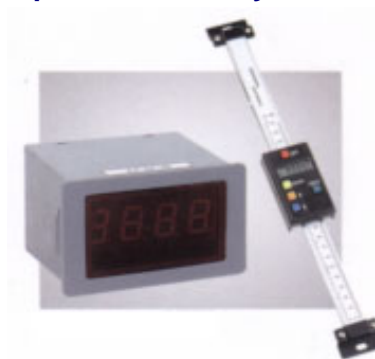
Depth gauge and tachometer